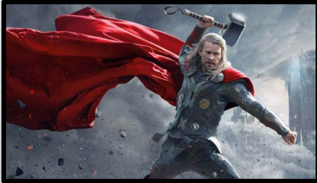
Thor: the Warrior