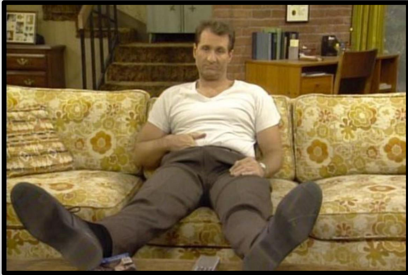
Al Bundy from Married with Children