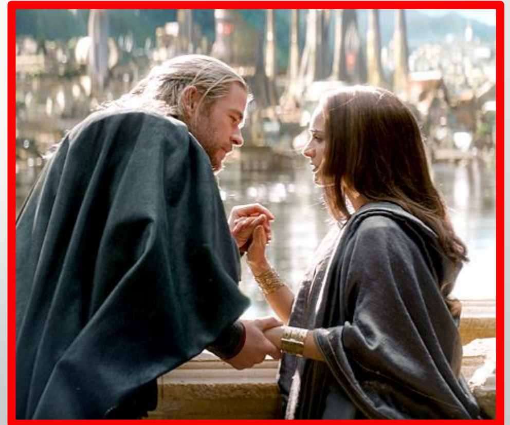
Thor: the Gentle Lover